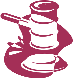
San Diego Memorial Society President